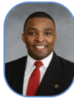
State Senator Don Davis